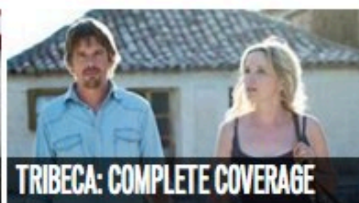
TRIBECA: COMPLETE COVERAGE