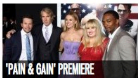
'PAIN &amp; GAIN' PREMIERE